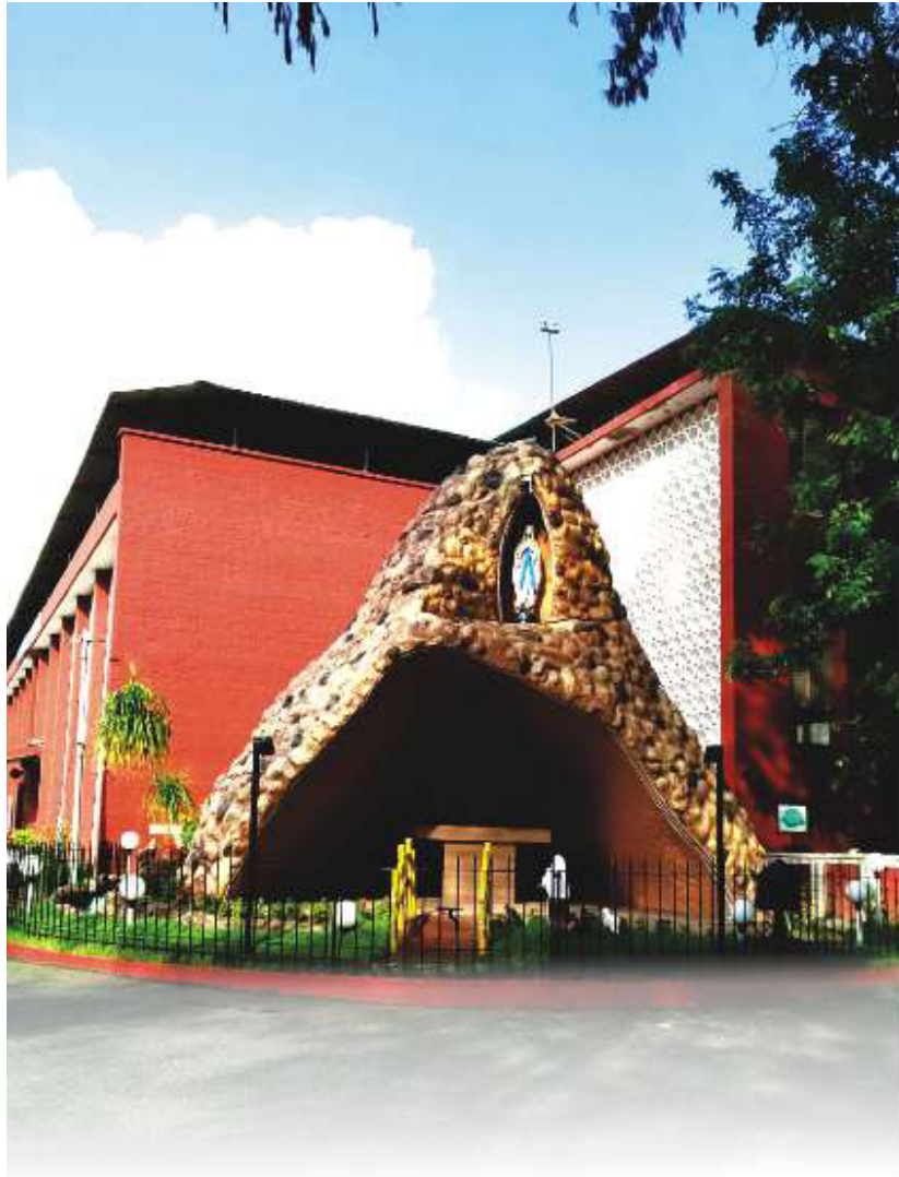
PRINTERS COMPLEX, TUM